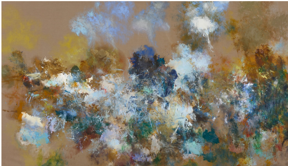
Myonghi Kang, Pacific , 2012. Oil on canvas, 288 x 500 cm

“It’s been found again. What? Eternity. It’s the sea uniting with the sun.” Excerpt from L'éternité by Arthur Rimbaud