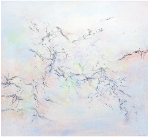
Zao Wou-Ki, Les Poisson de Marie-Laure , 2004. Oil on canvas, 150 x 162