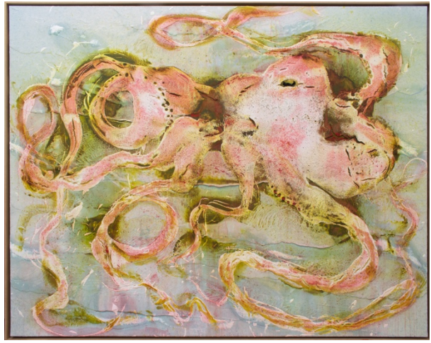
Miquel Barceló, Pieuvre , 2011. Mixed media on canvas, 190 x 240 cm

L'éternité rediscovers the concept of eternity through each artist's visual dynamism across multiple generations. After the pandemic, we have become more aware of the fragility of time and life. Each artist featured in the exhibition transcends the passage of time as they use different techniques to convey a sense of motion, change, and transience. Whether it is within the structured stanza of a poem, or a frame of a canvas, each selection of a word and a brushstroke becomes a physical embodiment of a continuing process. Deciphering sensations around nature and eternity, the exhibition examines our changing attitudes toward the perception of time.