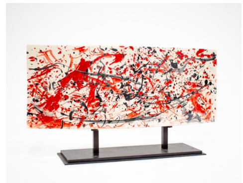
Zao Wou-Ki, Sièle Delille n° 8 (noir et rouge) , édition 2/8, 2007