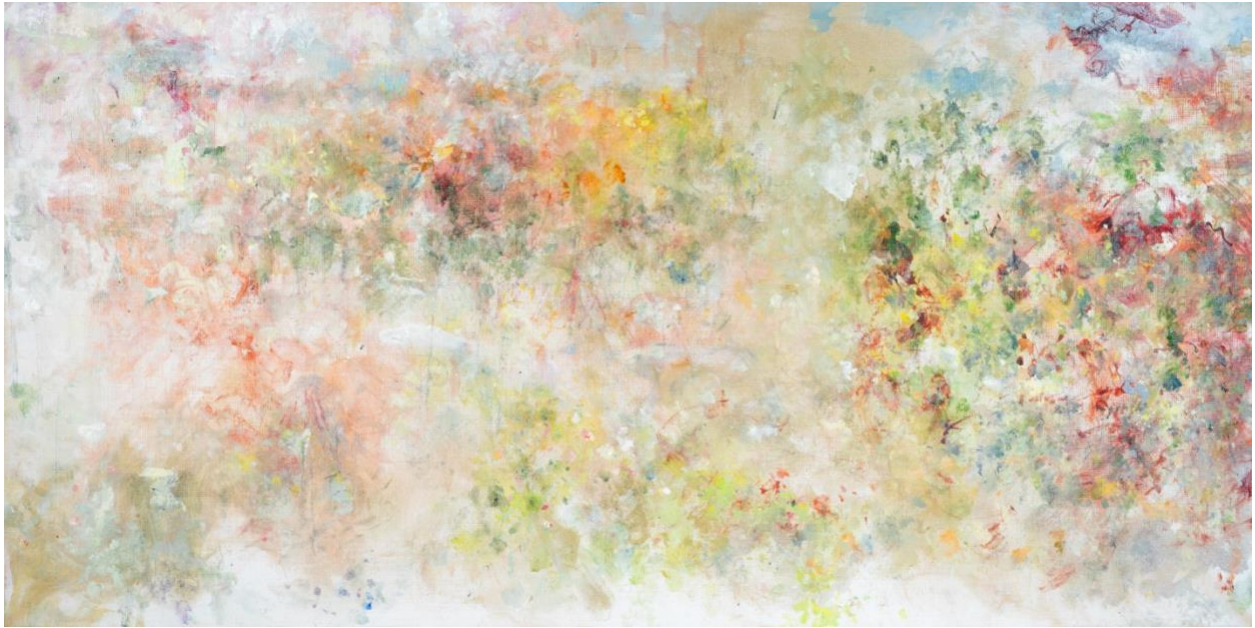
Myonghi Kang, Jardin public à Taipei , 2023, Oil on Canvas, 50 x 100 cm

Hong Kong, [March 2024] - In our increasingly technology-driven society, where the rapid pace of progress often overshadows the gentle whispers of nature, a compelling voice emerges, demanding to be heard. Villepin is delighted to present an exhibition showcasing the visionary works of Myonghi Kang—a powerful call to reconnect with the very essence of our existence.