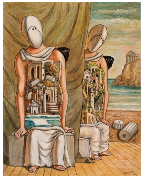
Giorgio de Chirico, Il dialogo misterioso (Archeologi) , 1970, oil on canvas, 90 x 69.8 cm