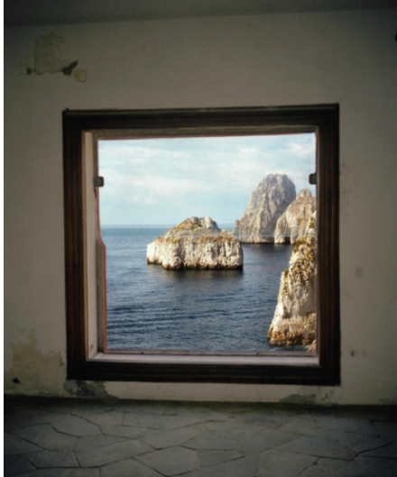
Casa Malaparte, Capri, Italie, 1998