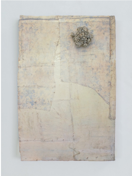
Lawrence Carroll, Untitled , 2013, oil, wax, plastic flowers, and canvas on wood, 88.2 x 58.3 x 14 cm

Lawrence Carroll's quiet visual language speaks of the search for belonging in the metropolitan crowd; subtle coloring often employed with inconspicuous materials to produce works lavished by geography and time. As the artist once said, "things come when they come. In this ever-changing world this is a luxury I crave. To slow down, to wait, to look. By choice I have chosen to live away from things, and by doing this I have given myself the freedom to wander and take my time." Playing with soft colors, almost white, sometimes blue and yellow, Carroll's paintings exist in an atmosphere of silence that conveys hidden messages to our senses and souls. While looking at Morandi, Carroll was drawn to the portrayal of beauty in essential things; for both artists, the repeated capturing of subject matter was a meditative and introspective practice.