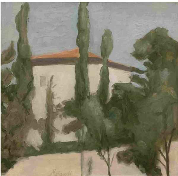
Giorgio Morandi, Paesaggio , 1943, oil on canvas, 49 x 50.5 cm

Slowing down our perception of time, Carroll's works invite introspection while Cy Twombly engages a profound level of contemplation through a gestural vocabulary that is charged with frenetic energy. Both Carroll and Twombly's works create a common ground for reflection, depicting the invisible soul, and suspending the viewer in a moment of spirited sublimity amid surrounding noise.